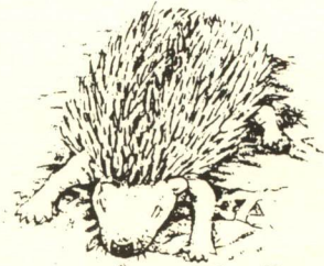
One week old Hoglet

with plenty of newspaper. For bedding use some old (but not threadbare) towels. Place a hot water bottle, filled with hot – not boiling water - wrapped in a towel or warm material, in the bottom of the box (a reptile heat mat or heated propagator may be used instead) Put the hoglets on this and cover with further bedding. The hot water bottle will need to be changed every few hours to keep the hoglets warm.